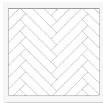
Selected woods available in a Parquet laying pattern.

In authentic wood designs with timeless appeal, Parquet will forever be admired. Versatile and sophisticated in any room.