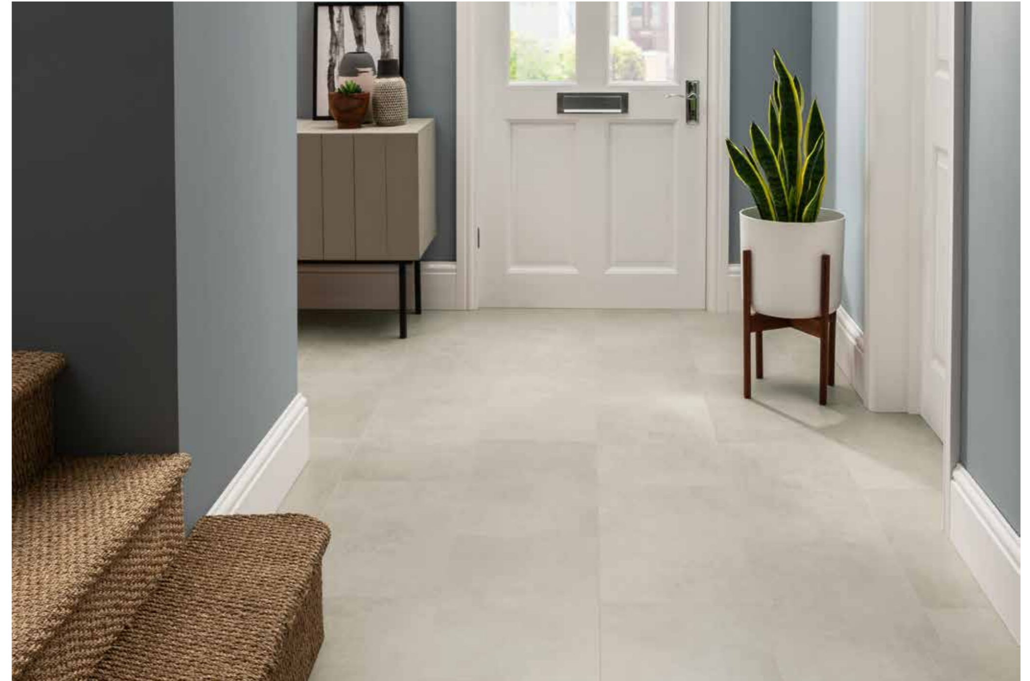
Lyme in Broken Bond laying pattern - SB5S2789