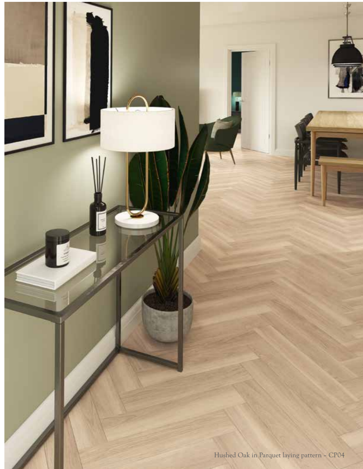
Hushed Oak in Parquet laying pattern - CP04